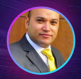
Judge - Taher Abou-eleid

Judge & President at the Court of Appeal Ministry of Justice, Egypt